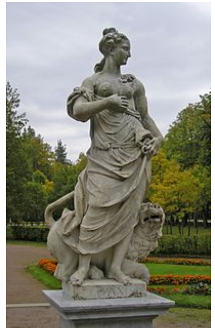
Statue of Peace in the garden of Pavlovsk Palace